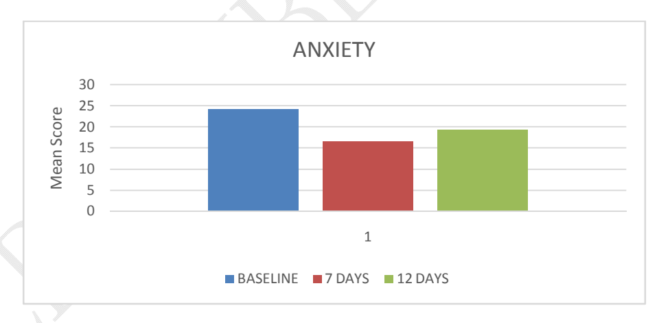
Figure 4 Mean Beck Anxiety Inventory Scores by Day

The above graph shows mean scores for Rosenberg Self-Esteem Scale including: baseline test (before the intervention), seventh day test (immediately after the intervention) and twelfth day test (5 days after the termination of intervention). The results show that comparatively, there was an increase in the self-esteem among the participants after the practise of Osho's Dynamic Meditation. And it was also evident that termination of the meditation practise had resulted in an alteration in the self-esteem of the participants. The results of the study were in accordance with the study conducted by Naved Iqbal, Archana Singh, Sheeema Aleem and Samina Bano (2014) stated that meditation practise increases self-esteem. The results of the study present study were indirectly related to the study of Naved Iqbal, Archana Singh &Sheema Aleem (2016) stated that practise of dynamic meditation increases the awareness towards own self, serving as a factor to improve the self-esteem.