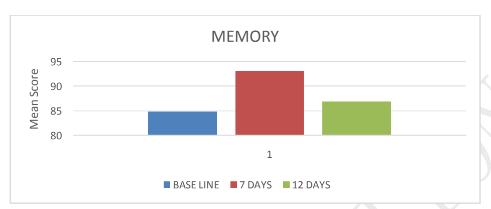
Figure 1 Mean Digit Memory Test Scores by Day

The above bar graph shows the mean scores of the Digit Memory Test at the three levels of test including: baseline test (before the intervention), seventh day test (immediately after the intervention) and twelfth day test (5 days after the termination of intervention). The results show that comparatively, there was an increase in the memory level in the participants after the practise of Osho's Dynamic Meditation. And it was also evident that termination of the meditation practise had resulted in a mild variation in the memory. This result was in accordance with the study of Anurag Joshi, OP Goyal and VK Gupta (2007), who stated that regular practise of meditation improves the memory. The results were also in accordance with Rachna Butola and Renu Chauhan (2014) who stated that two weeks practice meditation can enhance the memory of the normal individual.