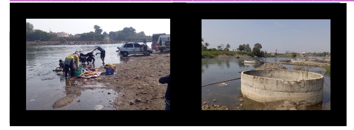
Zone III Vehicle washing Zone IV Excessive water withdrawal