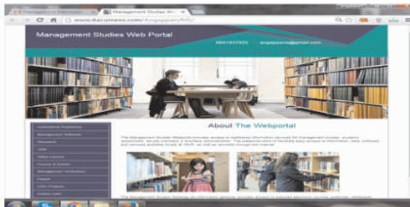
Figure1: Home page of the Management studies Portal

Design of Web Portal: After creating the databases and deciding the hardware and software requirements, the prototype portal design process commenced. The web portal has been named as management studies portal which stands for management and business administration information.