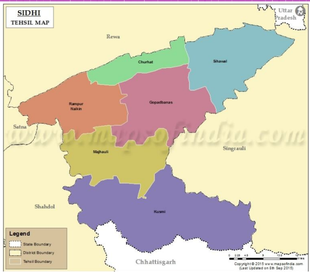
Fig-2: Sidhi District Tehsil Map

Table-1: Sampling Location, Majhouil Tehsil